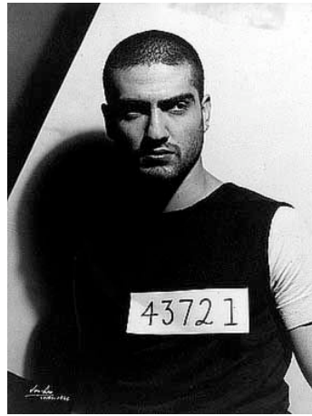
Figs. 3, 4, 5: Van Leo, Self Portraits (Left: 1942, Center: 1945, Middle: 1944)