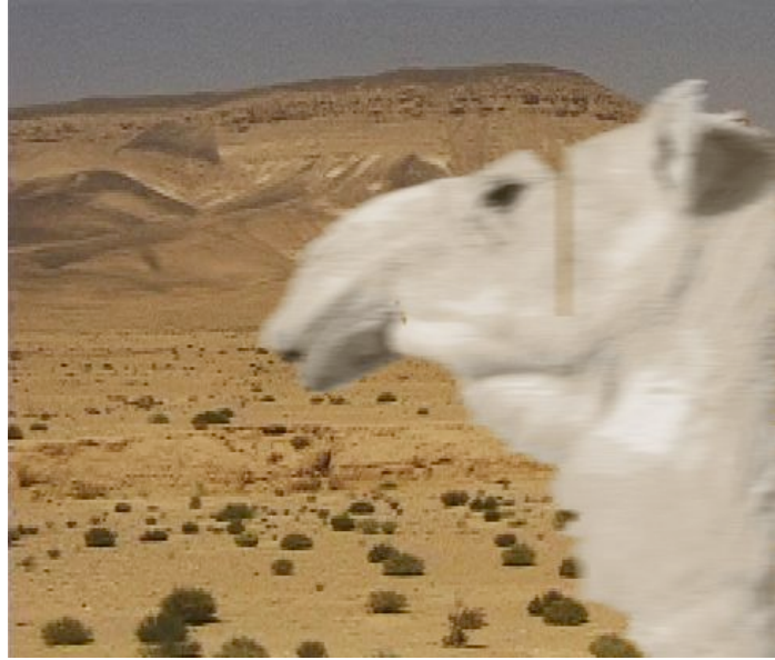
8. Akram Zaatari. This Day . (France/Lebanon, 2003, 86 min, DV-Cam)