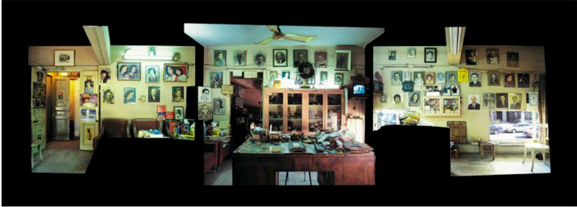
Fig. 10: Akram Zaatari, Objects of study / Studio Shehrazade / Reception Space , Colour lightjet print, 350 cm x 127 cm