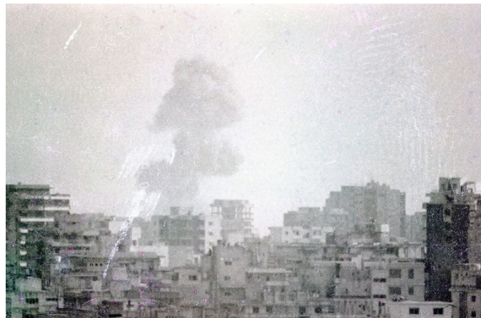
2. Walid Raad BEY82_City_II (from the series Untitled (1982-2007) ) 1982-2007, Archival color inkjet print, 111.8 x 170.2 cm