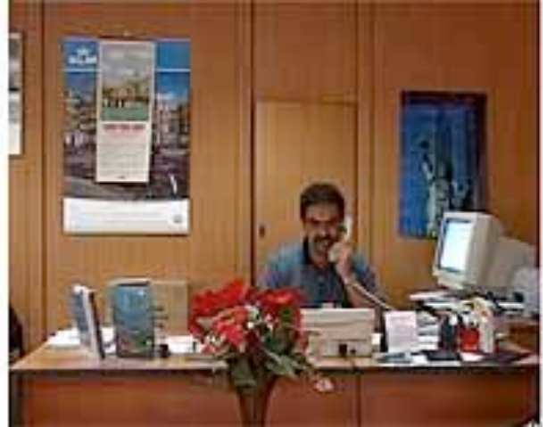
Fig. 2 Emily Jacir Ramallah / New York , 2004 – 2005 Two channel video installation on DVD Dimensions variable, 38 minutes